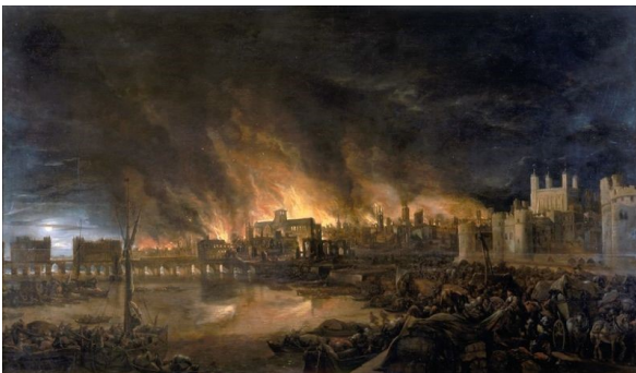
Image of the Great Fire of London