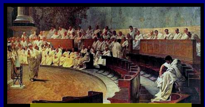
Laws – The Roman Senate