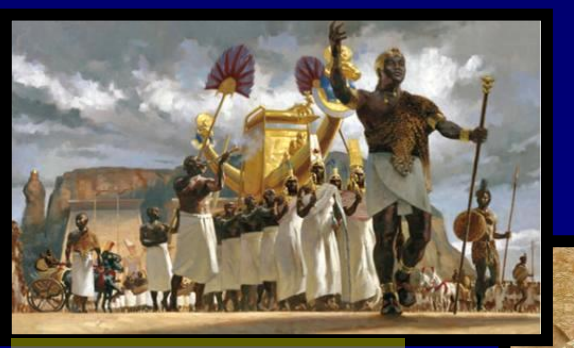
Ancient Egypt; 5000 BC – 100AD