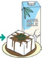
soya milk and tofu